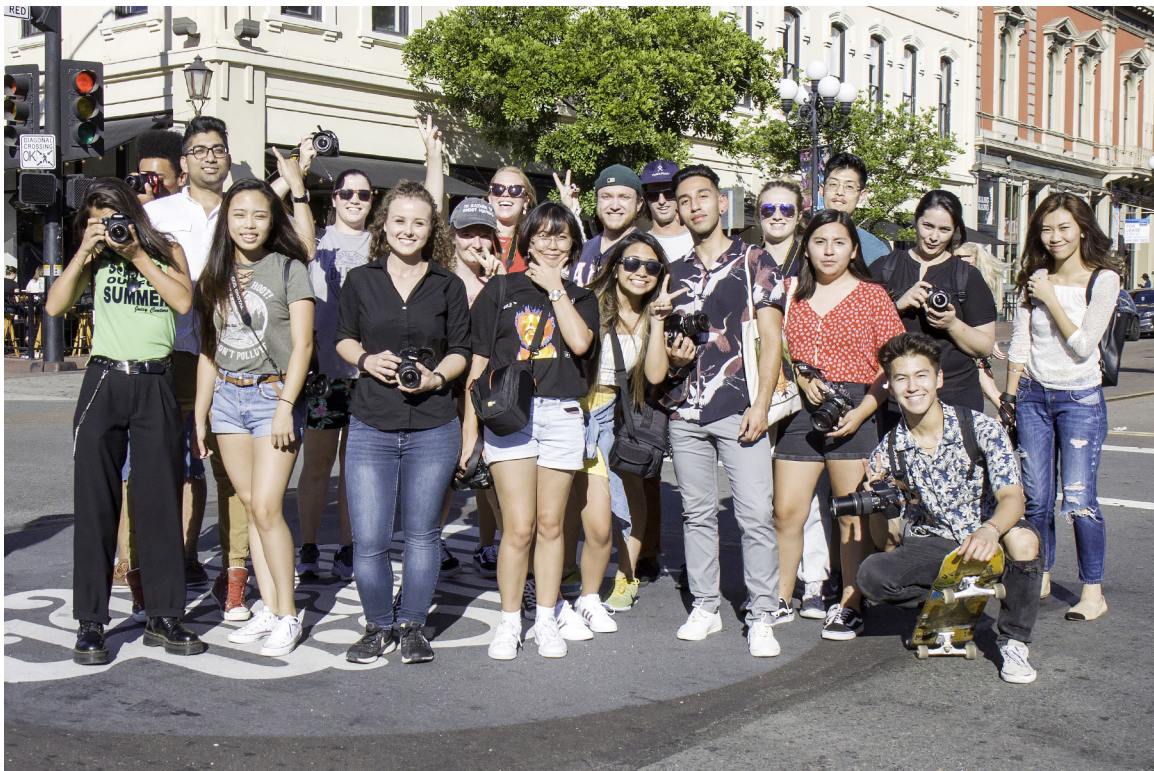
Class Field Trip To Gas Lamp Quarter, San Diego, California