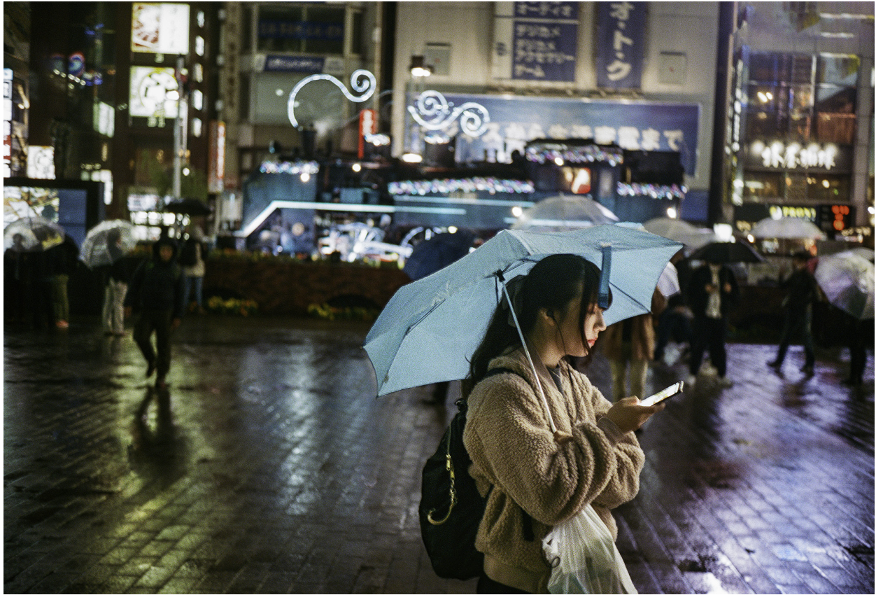
Chuo Ward, Osaka, Japan